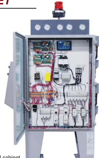
Titan electrical cabinet

* Water condensed only. Air condensed remote condensers require separate power.