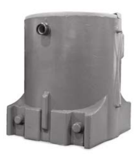
Polyethylene reservoir with insulation

The standard patented reservoir is a one-piece seamless design, rotationally molded from linear low density polyethylene and insulated with 3/8" dense foam insulation. The rectangular base accepts straight-line pump connections. The cylindrical shape adds structural strength. A tank baffle provides true 'hotcold' operation. The standard service cover has cut-outs for distribution piping and an inspection opening. The tank volume is adequate to support expansion to 2 times its original chiller capacity (adding APT-RC or WPT chilling module and additional pumps).